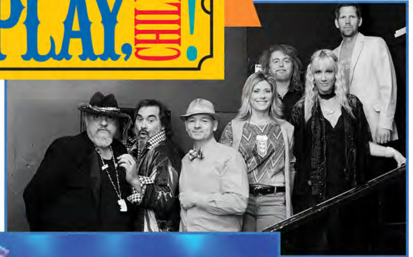
Rumours – A Tribute to Fleetwood Mac (pictured above), 8-11pm