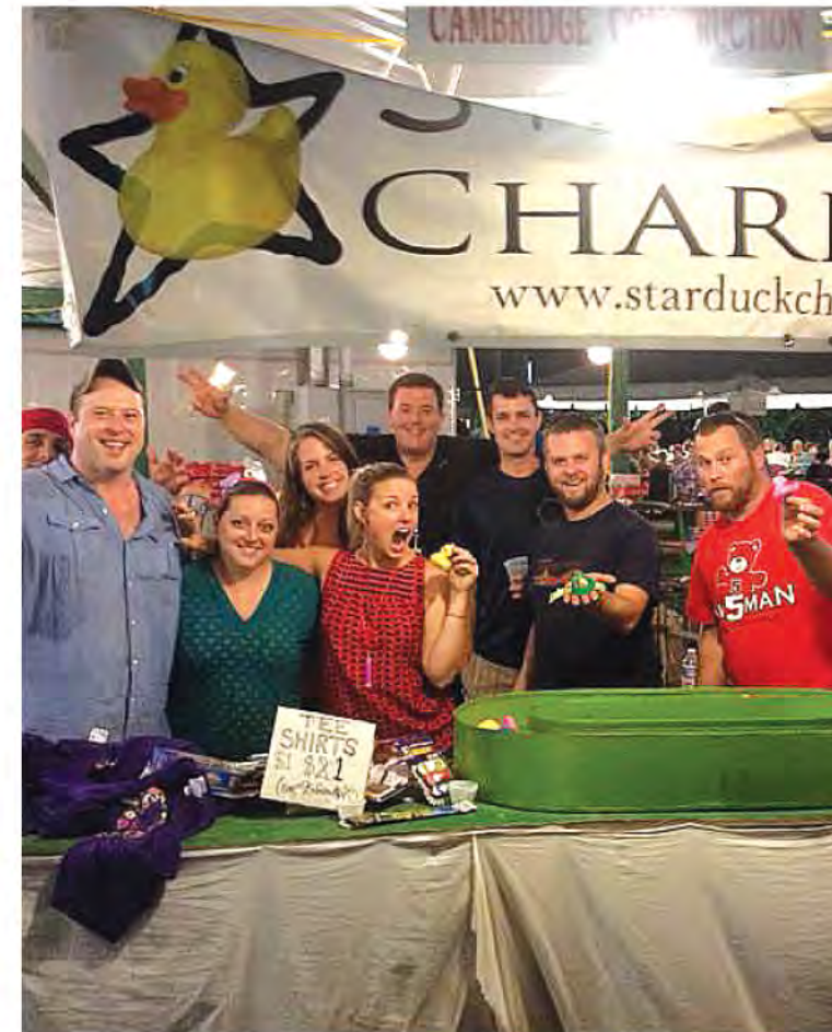
Star Duck Charities, Picnic 2014

The Duck Pond booth at the annual Picnic is always memorable. It's all in good fun and the kids who come to the booth have a good time. I encourage everyone to stop by and say "Hi!"