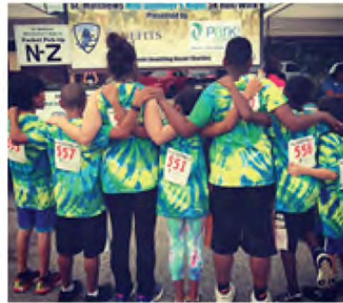
Top left to right: Trick-or-treating on Hillcrest Avenue, Star Wars movie night with the 501st Legion, Child Advocacy Day at the Kentucky state capital and St. Matthews' Midsummer's Night 5k.

St. Joe's Residential Treatment program has experienced a lot of positive growth over the past year as 100% of St. Joe's kids transitioned into a safe and loving home in 2017. Currently, St. Joe's is home to 48 children, ages 6-14, including boys, girls, and sibling groups who have been removed from their homes due to abuse and neglect. Our goal at St. Joe's is to provide the children with the necessary tools to be successful in a family. Through trauma-informed care, individual treatment plans, intensive therapy, education, therapeutic activities and a normal home-like environment, children can begin the healing process. It is not uncommon that a child will say, "For the first time, I feel safe." St. Joe's provides stability and treatment for some of Kentucky's most vulnerable children by working every day to achieve our mission of Giving Children a Home .