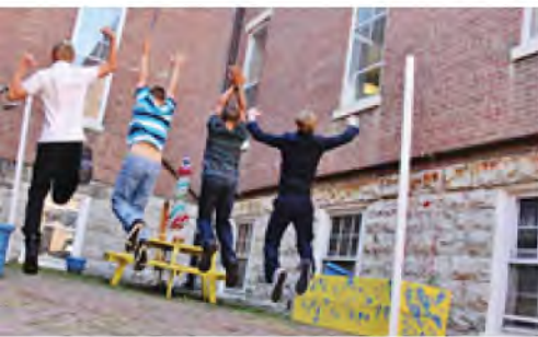
Above and right: School photos with Missy Smiles Photography, Reading with peers in the cottage

Keep up with St. Joe's kids by following them on Facebook and Instagram @stjosephchildrenshome