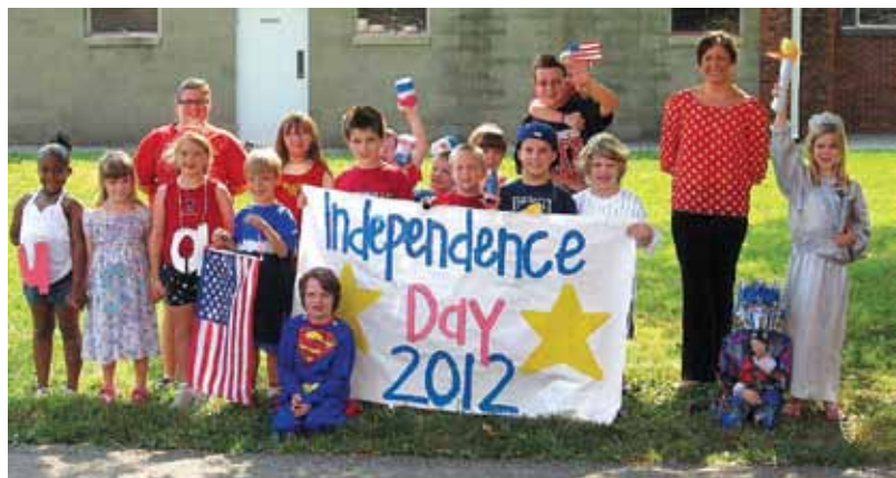
CDC children celebrated Independence Day with a parade on the grounds.

These children are a major part of our community and St. Joe's is