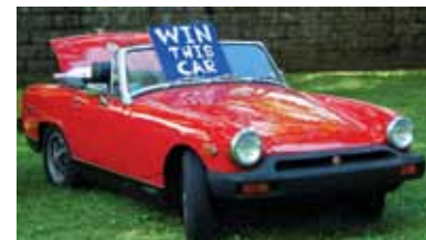
The British Car show benefits our kids each year. This year there was a raffle on this fabulous car.