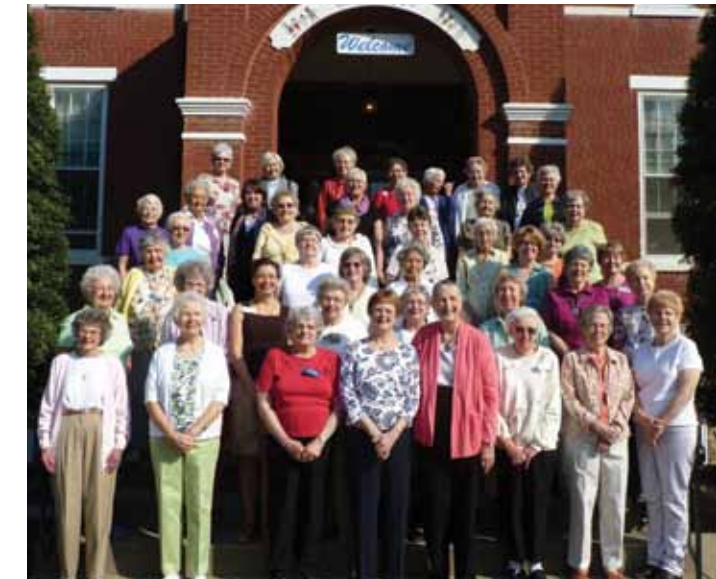
The St. Joseph Sewing Ladies gather for a 100th Anniversary picture.

The majority of quilts are raffled at the picnic, with others raffled around Christmas and Mother's Day. The Society also hand embroideries beautiful pillow cases to be raffled at the picnic and sold throughout the year.