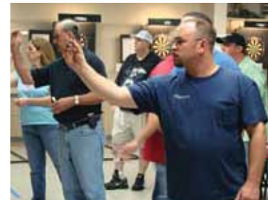
Thanks to the Greater Louisville Dart Association for their yearly support.