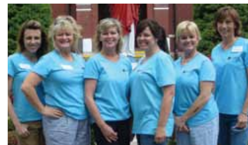
Thanks to Kentucky Select Properties for volunteering at St. Joe's.