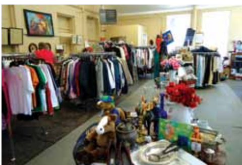
One-of-a-kind treasures are discovered every day in the newly renovated Thrift Store.